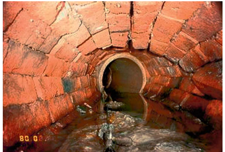
This photo, transmitted by CCTV, shows a sewer on the verge of collapsing

The SSES is divided into 6 parts, or sewer groups, according to the severity of their condition. The SSES for Sewer Group 1, those sewers identified as having the most critical repair needs, is scheduled to begin in June 2002.