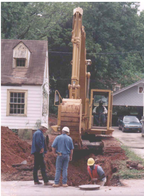
Open-cut construction on private property.

For more information, questions or concerns, call the Clean Water Atlanta Helpline at 404-529-9211.