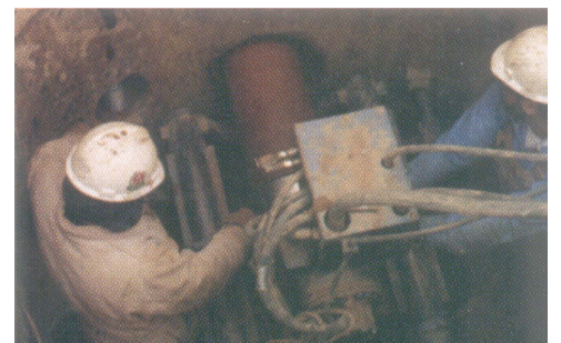
Open-Cut construction and microtunneling are two methods used in constructing new sewers.